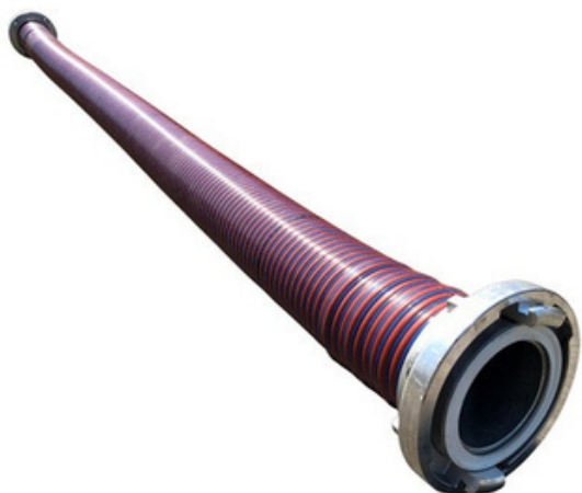
Suction (intake) hoses - illustrative photo