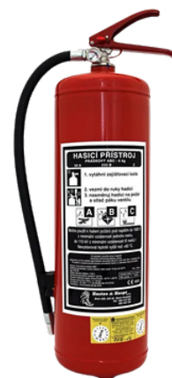
Portable fire extinguisher - illustrative photo