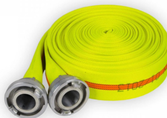
Working (pressure) hoses - illustrative photo