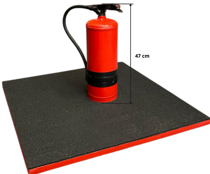
Portable fire extinguisher for youth - illustrative photo