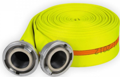
Main (pressure) hoses - illustrative photo