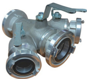
Three-way (cock) branching - illustrative photo