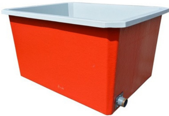
Water tank with capacity of - illustrative photo