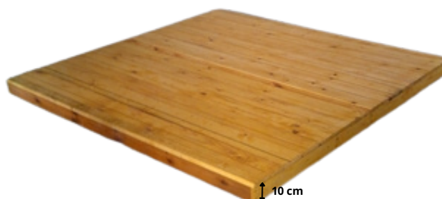
Shield for laying the equipment - illustrative photo