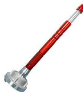
Non-cock nozzles (without shut-off) - illustrative photo