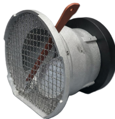
Suction strainer - illustrative photo