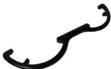
Keys - illustrative photo